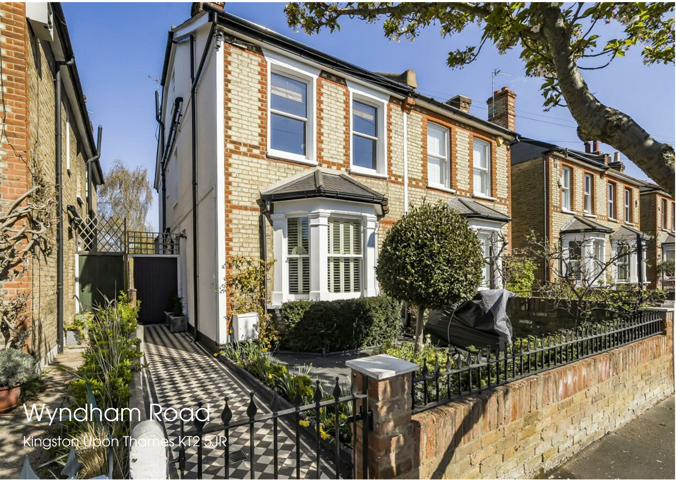
Wyndham Road Kingston Upon Thames KT2 5JR